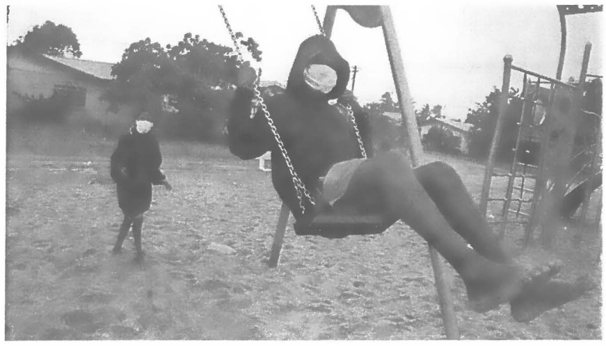
Queensland has successfully trialled Indigenous service delivery reforms in Yarrabah, near Cairns.